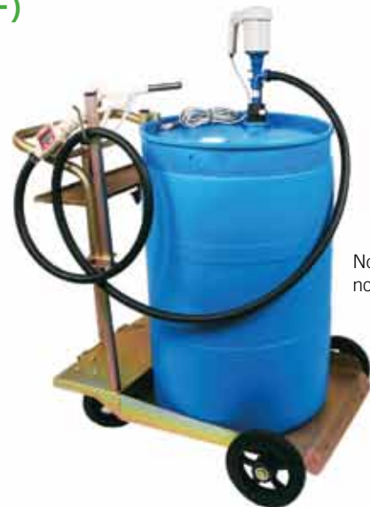
Note: Drum not included