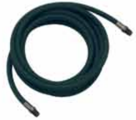
IS DEF Hose An EPDM hose with polyester braid reinforcement. This hose is processed without any zinc during manufacturing and has been peroxide cured for use with DEF. Contact Liquidynamics for additional hose lengths and fitting options. P/N 81240-10 3/4" x 10' DEF hose w/ male NPT fittings both ends P/N 81240-12 3/4" x 12' DEF hose w/ male NPT fittings both ends P/N 81240-15 3/4" x 15' DEF hose w/ male NPT fittings both ends P/N 81240-20 3/4" x 20' DEF hose w/ male NPT fittings both ends P/N 81240-25 3/4" x 25' DEF hose w/ male NPT fittings both ends P/N 81240-50 3/4" x 50' DEF hose w/ male NPT fittings both ends