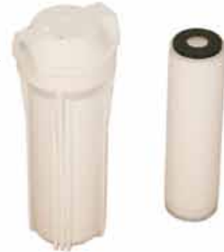
IS P/N 70176-01 Replacement filter element for above filter assembly, 1 micron