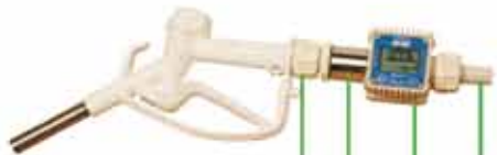
P/N 100377 P/N 100378 P/N 100376 P/N 100386