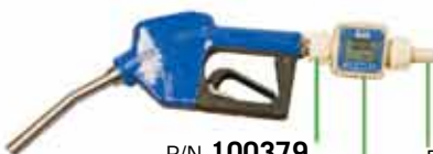
P/N 100379 P/N 100378 P/N 100386