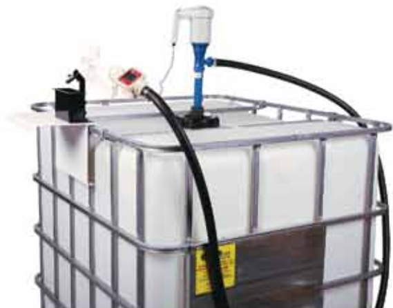
Note: IBC Tote Tank not included