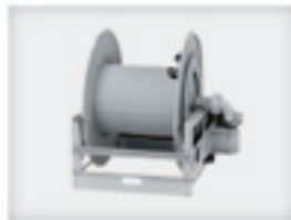
... Hose reels