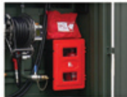
Spill kits & fire extinguisher