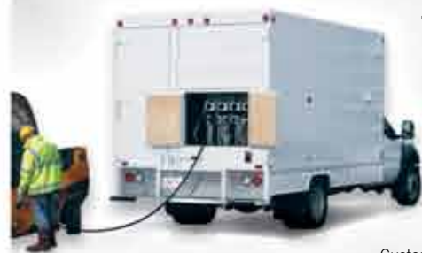
Custom Built Mobile Truck System Shown