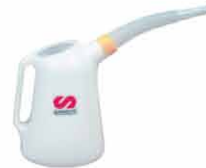
MODEL 2377 5 Litre Plastic Oil Measure