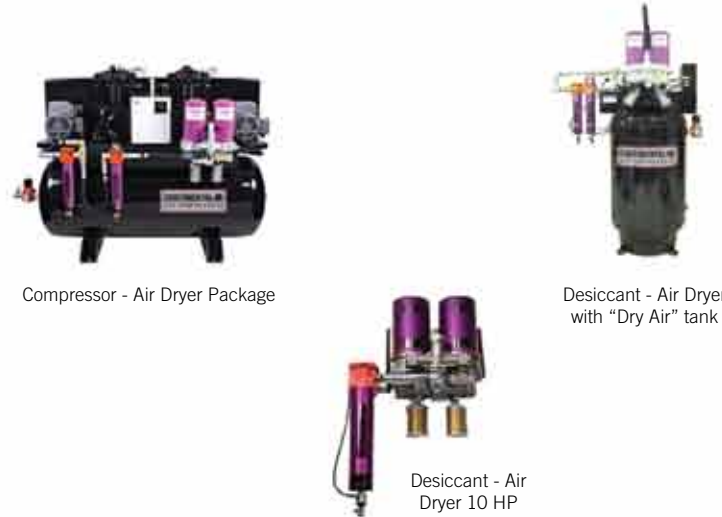
Compressor - Air Dryer Package