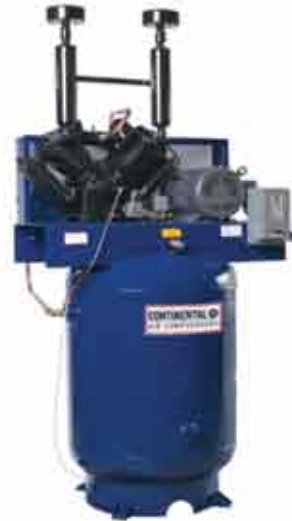
I10312VC2-S (Fully Loaded)